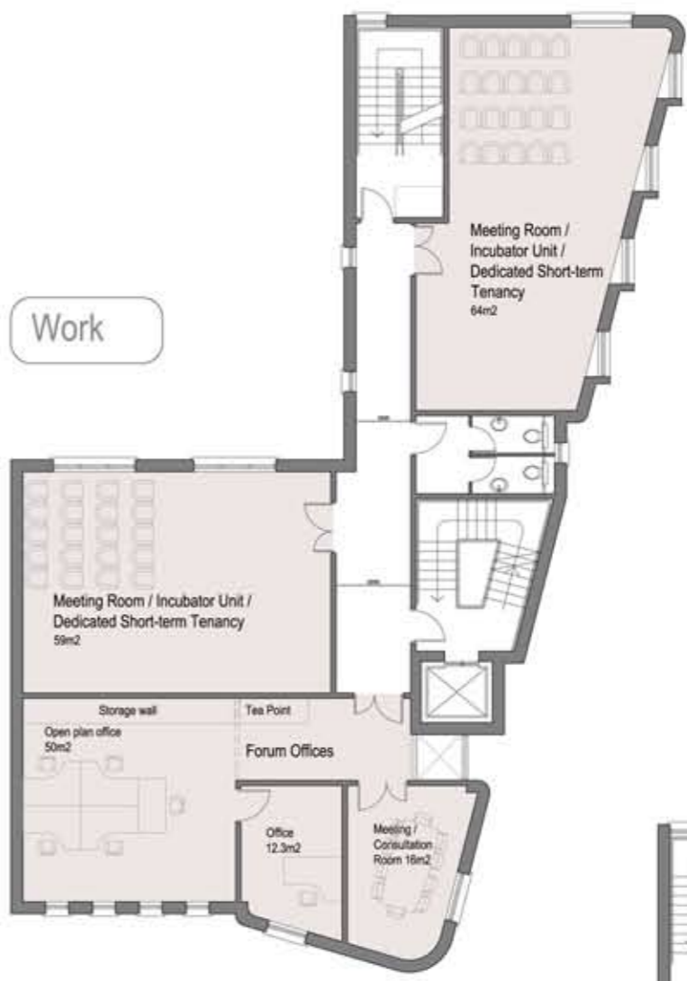
Second Floor Plan scale (A1-1:100) (A3-1:200)