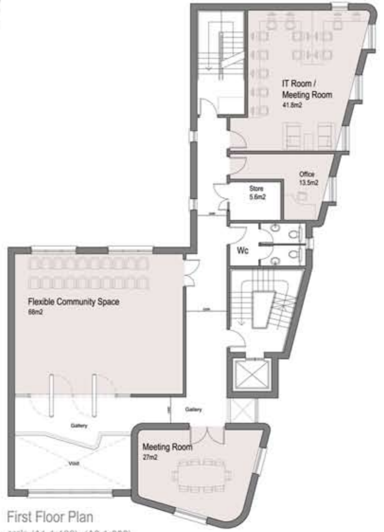
First Floor Plan scale (A1-1:100) (A3-1:200)