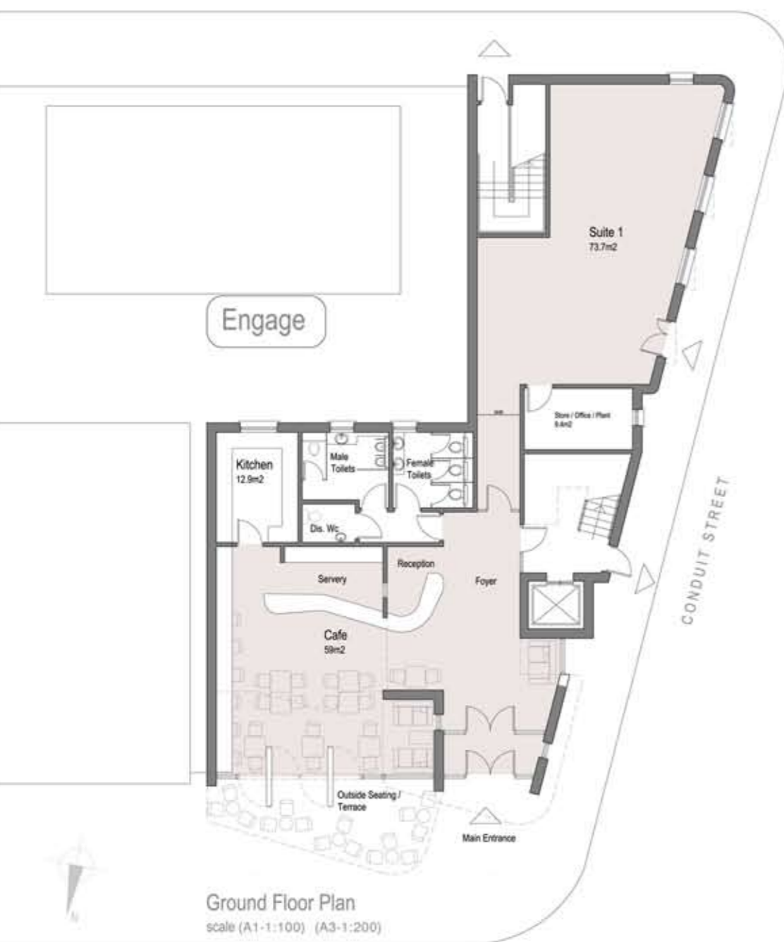
Ground Floor Plan scale (A1-1:100) (A3-1:200)